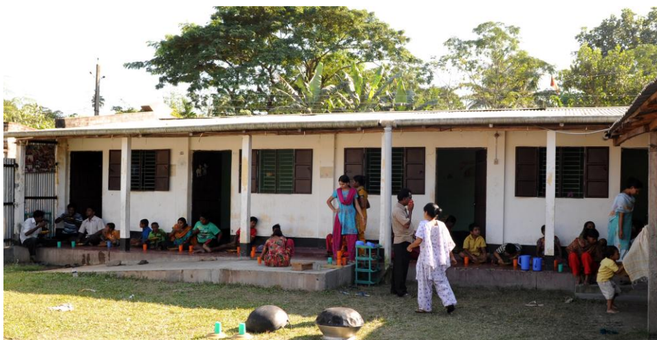
Tea - time in Shaymol Chaya