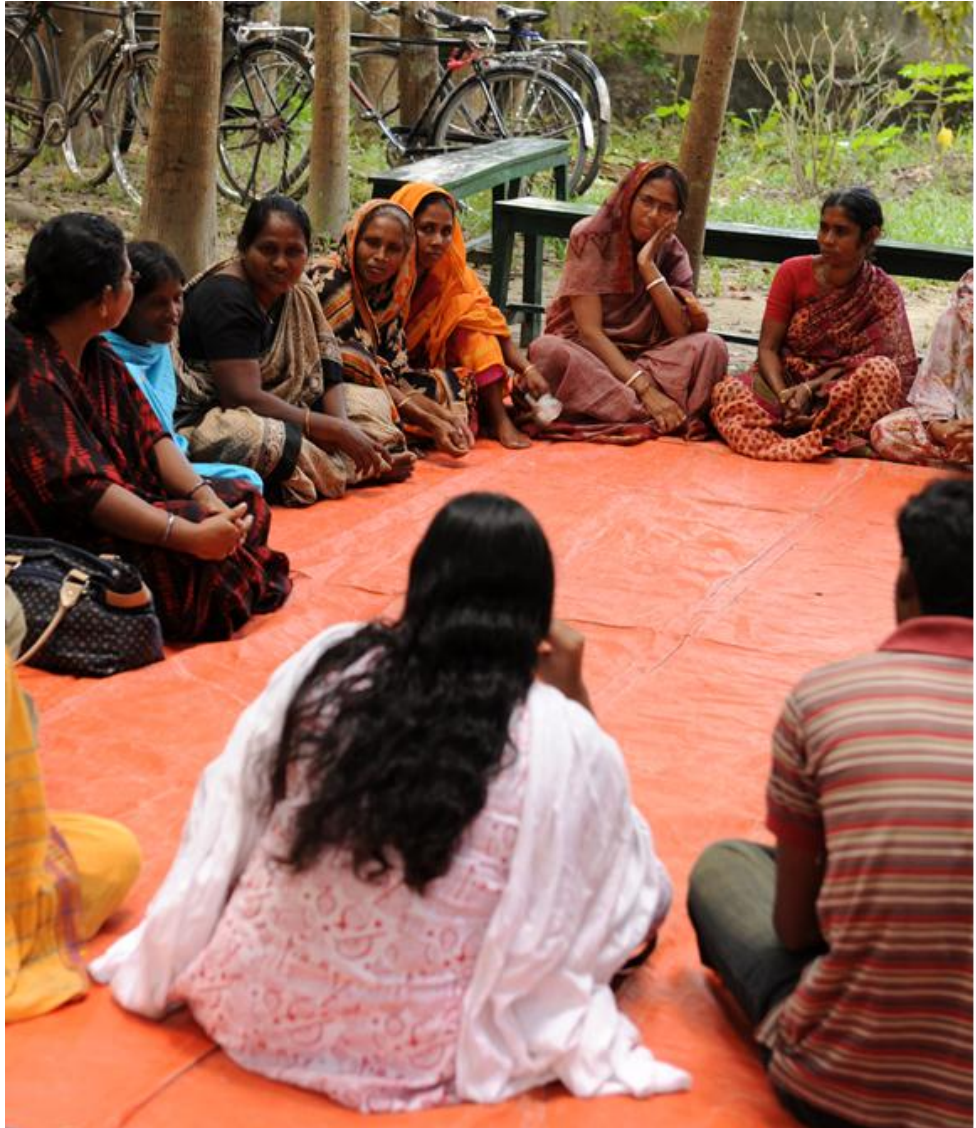
Mothers sharing about their children